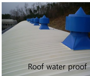
Roof water proof