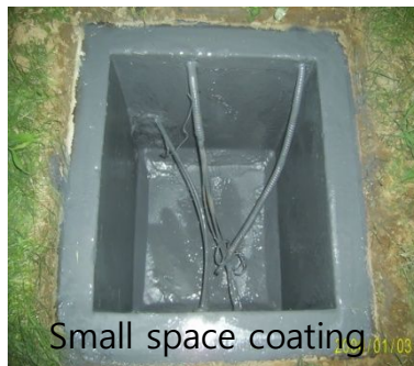
Small space coating