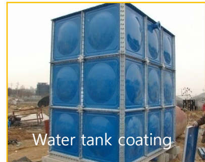
Water tank coating