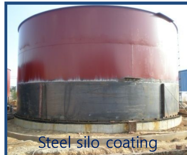
Steel silo coating