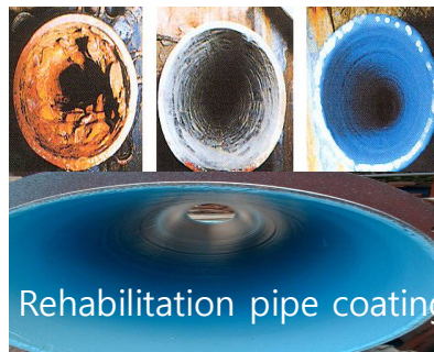
Rehabilitation pipe coating