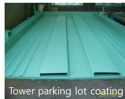
Tower parking lot coating

More additional information or technical questions . Please contact our company